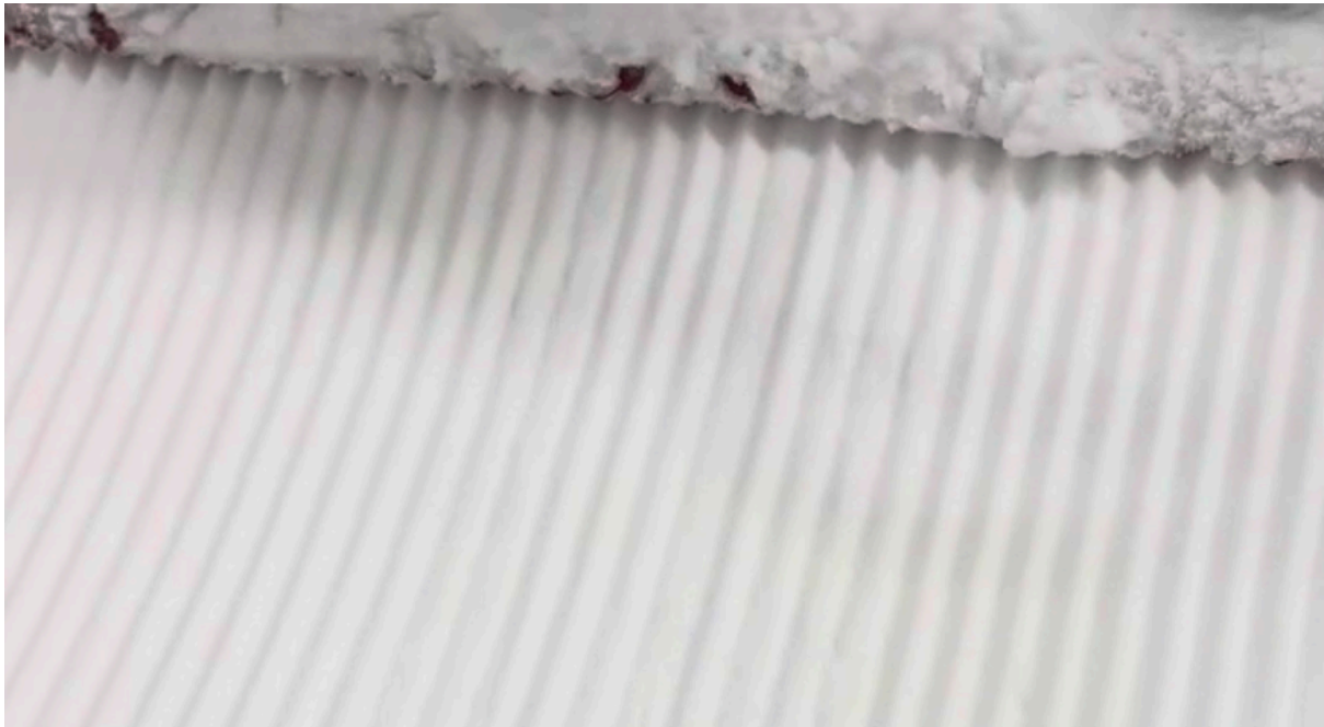
Real Snow. Perfectly groomed, powder snow is shown inside the Snowtunnel R&D scale tunnel.