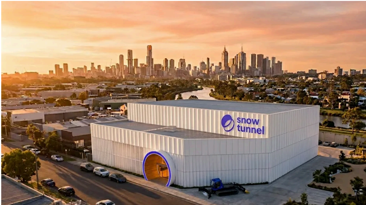
Future Flagship site concept. The Pilot Showcase Site will be based in Melbourne's booming West.

The Melbourne site is a bespoke showcase designed to demonstrate the technology's commercial and operational power. It will house the company's corporate headquarters alongside the star attraction: The Snowtunnel™ . The Melbourne Showcase Site will allow international partners, investors, and the public to experience the innovation firsthand ahead of a wider global rollout. The team is already fielding incredible interest in joining their exclusive Test Rider Crew, who will experience the Snowtunnel before anyone else.