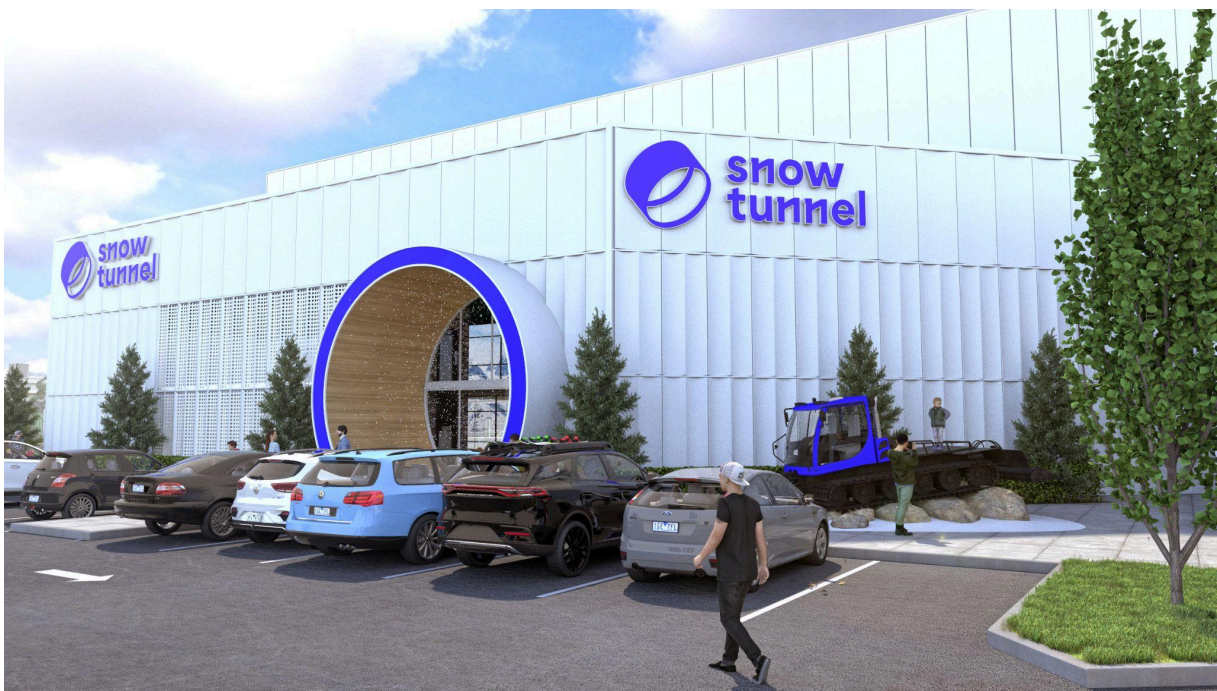
Snowtunnel Park locations and formats are planned worldwide.